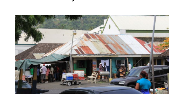
Makeshift roof by vendors